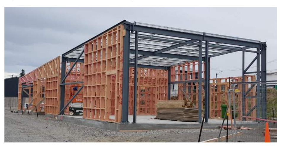
The frame is up for Taihape's new St John's Centre

If you would like to donate please send your deposit to: 03 0726 0000034 00.