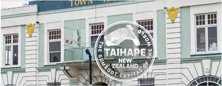
One of the iconic Taihape images on our new look website