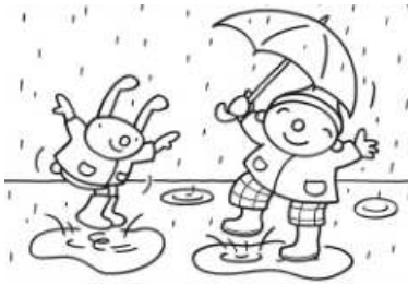
Under 5s template

by taking them to the 'gumboot decorating competition tent'. We will have a people's prize in addition to official judging so try to have your gumboots in by 10.30pm. You can indicate whether you want them back or not. Two categories, adults and under 13s. Finally, our Colouring in Competition . We have found four different templates, one for each age category. Entries need to be at the Town Hall by 3pm on Thursday 23 rd March.