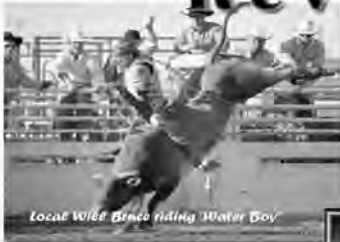
Local Wild Bred riding Water Boy